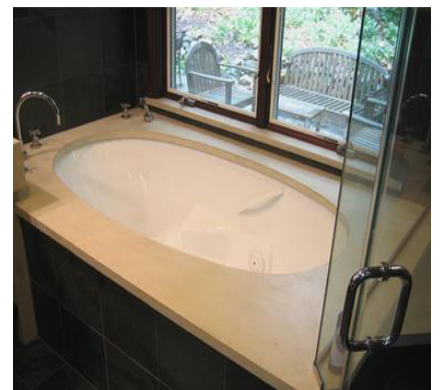
Tubs & showers